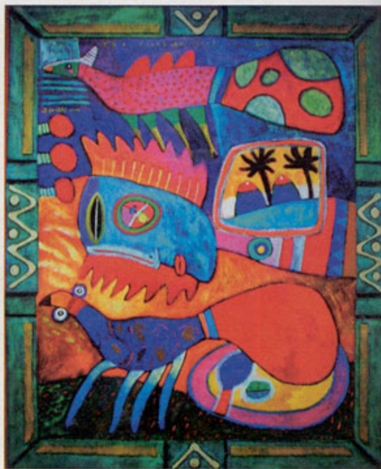
"The Floating Islands of the Caribbean" by Clemens Briels measures 22 by 20 inches and retails for $700. Briels calls his personal art philosophy "antipodism."