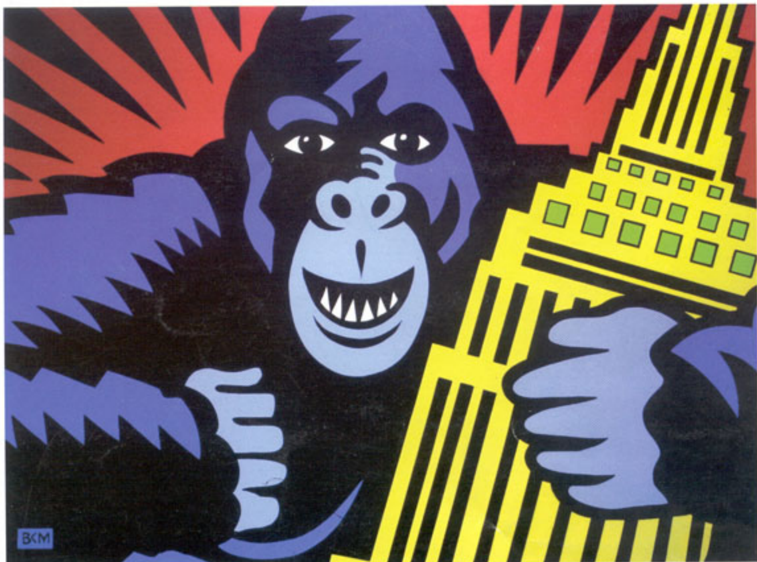
"King Kong" by Burton Morris