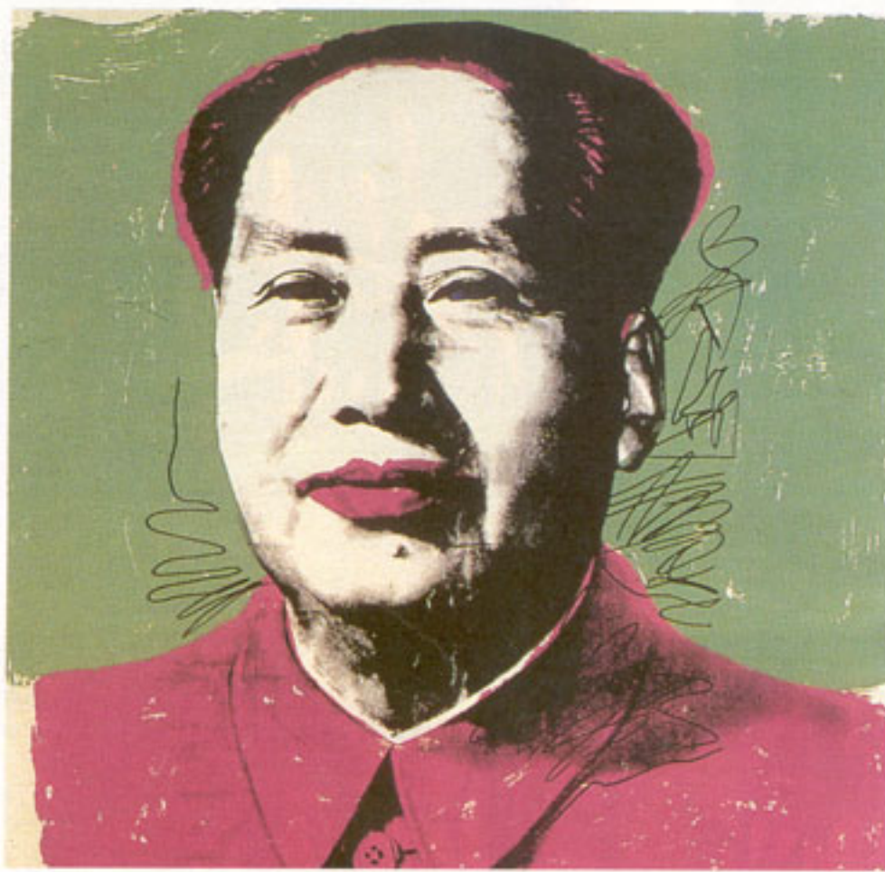
▲ Trinity Gallery featured Andy Warhol's screenprint "Mao" at its "Pop Icons: Modern Masters" show.

"People know me as the guy whose work they've